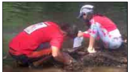
BS student Archie Espinosa searches for aquatic insects