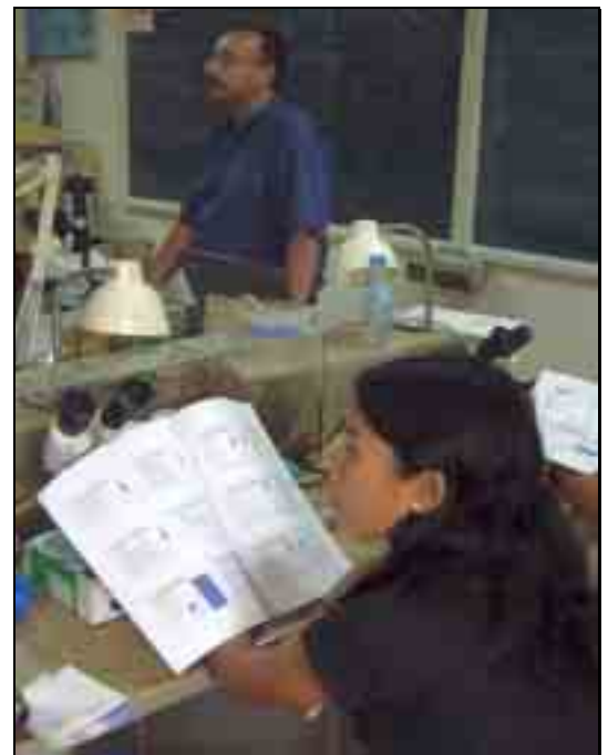
The handouts provided are a helpful teaching material