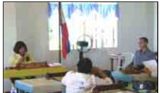
The project presentation at the Taytay Municipal Council session on September 3 rd 2007