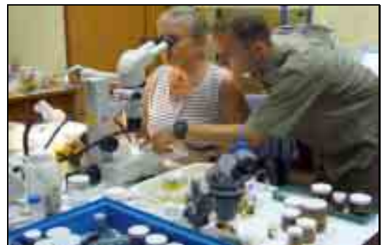
Checking of comparative material at the Raffles Museum of Biodiversity Research in Singapore