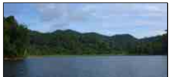
Lake Manguao, the only freshwater Lake in Palawan

Lake Manguao, locally also called Lake Danao, is the only natural freshwater lake on Palawan Island. It is located at the Municipality of Taytay at the north of the island. The lake was created by volcanic activities and covers about 600 ha. Its catchment is about 4500 ha large, drained by few permanent and several temporary streams.