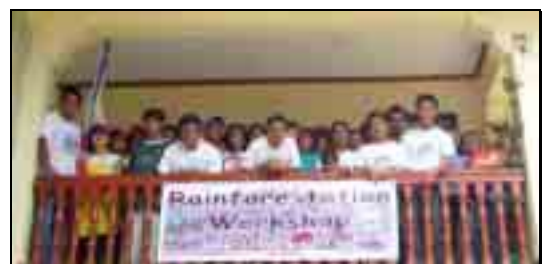
Participants of the Rainforestation Workshop in Taytay