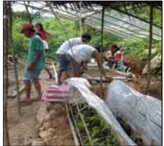
This nursery was established during the workshop

Further day meetings with the members of the new people's organisation were held in October and November 2007 to continue the "rainforestation" activities, to maintain and to monitor the nursery and the plantations.