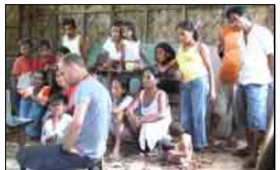
A meeting with residents of Sitio Danao, Taytay

The project follows a two-track strategy. A lasting conservation of biodiversity can only be assured if the local communities agree and support this vision. A community-based approach of the project therefore focuses on raising of people's awareness and on knowledge-transfer to the local communities. This particularly aims to introduce sustainable land use practices at the Lake Manguao area, such as “Rainforestation Farming”, an evaluated long-term method to increase both, livelihood standards and habitat conditions.