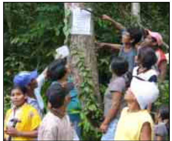
Workshop participants mark “mother-trees”