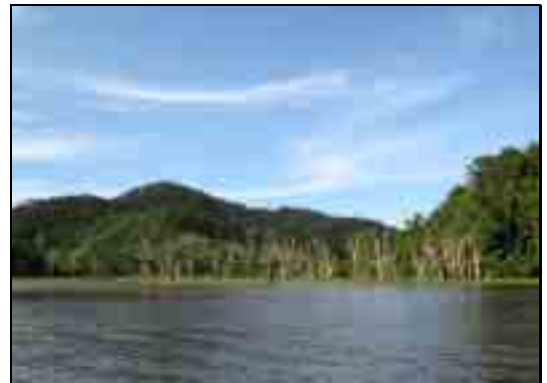
More efforts are needed for a lasting conservation and a sustainable use of the Lake Manguao Catchment