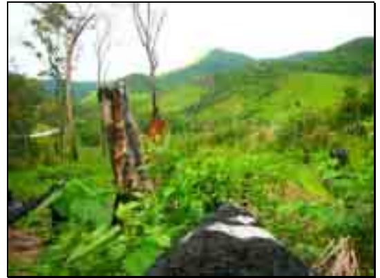
Fire clearance is a main threat for the Manguao area

Initial small-scale surveys already discovered a number of species endemic to the lake and its tributaries [e.g. http://rmbn.nus.edu.sg/rbz/biblio/52/52rbz227-237.pdf ] It can be assumed that it has an outstanding proportion of endemic taxa. This ecosystem is threatened due to land conversion as fire clearance and selective logging is still practiced affecting both, terrestrial and freshwater ecosystems. The executing authorities, the Palawan Council for Sustainable Development (PCSD) and the Provincial Government of Palawan aim at an effective protection of this key area of freshwater biodiversity in the Philippines by a Protected Area Suitability Assessment.