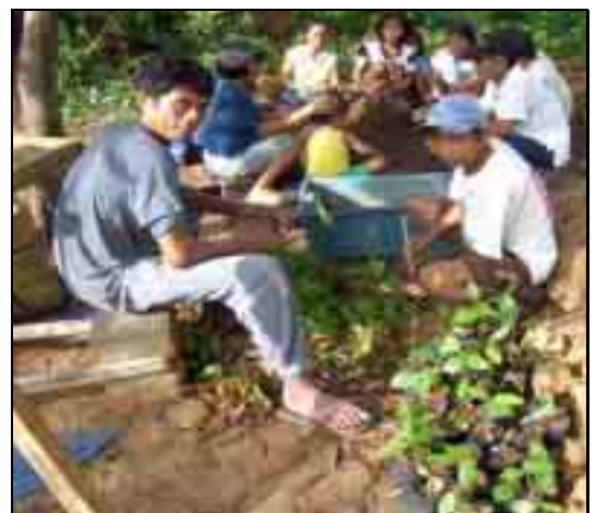
Dipterocarp seedlings are prepared for the nursery