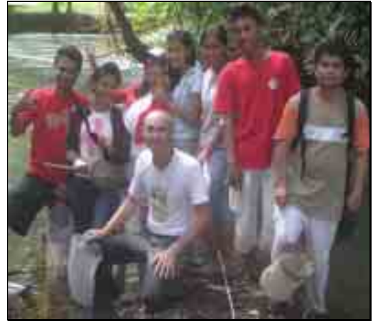
Training of junior scientists is one concern of the project