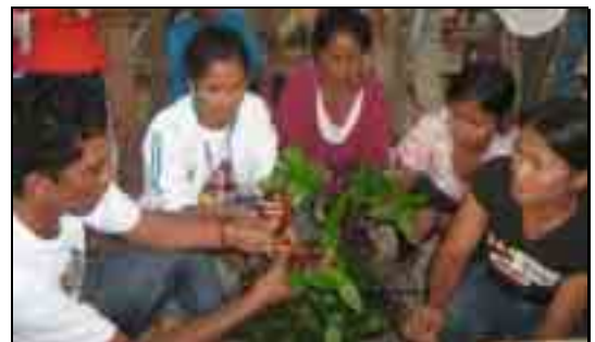
Sorting of the seedling collections