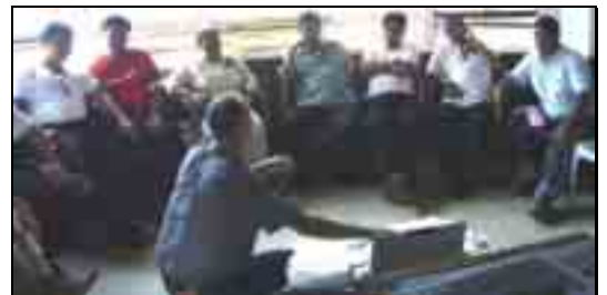
A discussion with municipal officials of Taytay