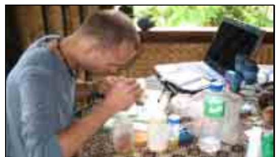
Identification of freshwater Decapods