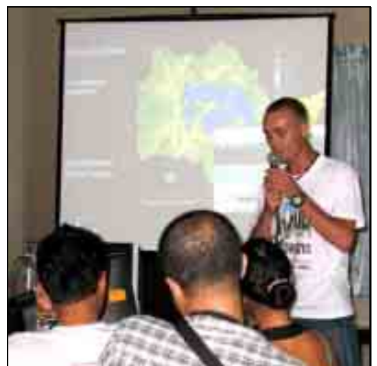
Project Presentation at the 5 th "Ecology and Fish Conservation Week" of the WPU on October 10, 2007