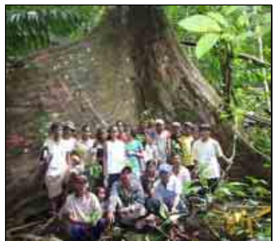
A huge "mother-tree" at Maranlatan Forest