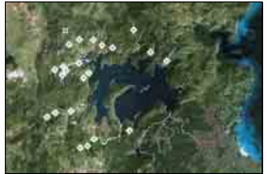
The sampling sites at Manguao Catchment

All macroinvertebrate specimens that could not be identified in the field were preserved in alcohol for subsequent determination.