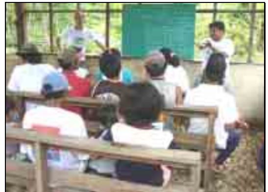
An exchange of information with locals of Sitio Danao