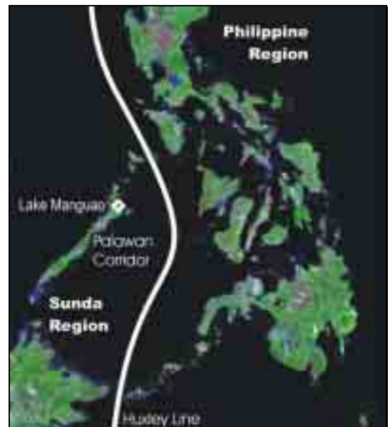
The location of Palawan in the Sundaic Region

Palawan, the Philippine Island and Province of the same name, represents a biodiversity corridor and hotspot within the Southeast Asian archipelago. It belongs to the faunal and floral complex of Greater Sunda. Due to a larger part of remaining forest cover compared to other Philippine islands, Palawan is called the “last frontier”. The entire province was declared a UNESCO biosphere reserve in 1991 and it is subjected to the specific “Strategic Environmental Plan” by the Senate and House of Representatives of the Philippines. However, the ongoing loss of biodiversity as a consequence of increased land use by a growing population urgently requires the protection of key habitats and a switch to sustainable land use practices. This requires knowledge and monitoring of the ecosystems.