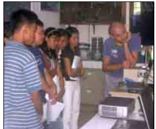
Students of aquatic science during a workshop lesson