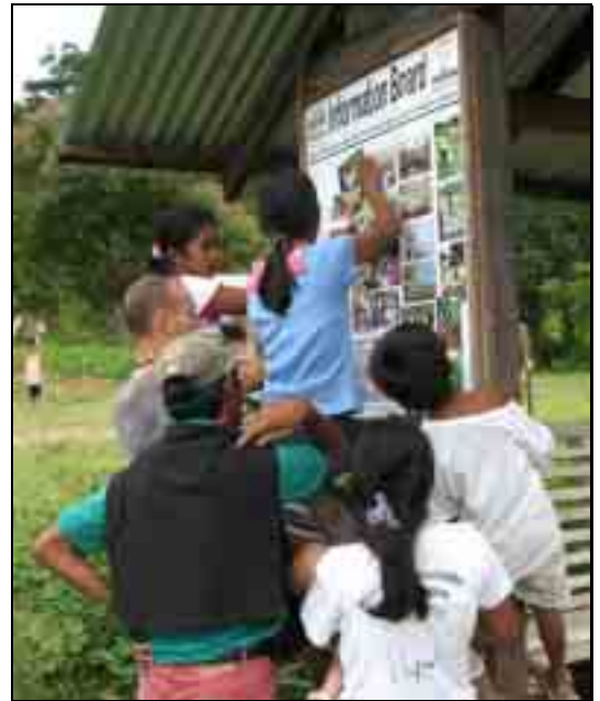
The information board at Sitio Danao